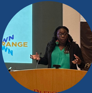
Small Business Advocacy & Support

We look forward to partnering with you to ensure the success of South Orange Downtown