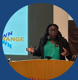
Small Business Advocacy & Support

We look forward to partnering with you to ensure the success of South Orange Downtown